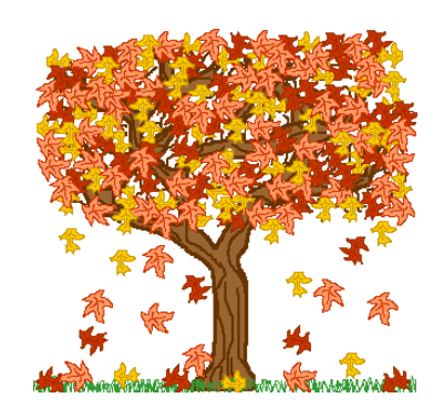
Four year olds

The four year old's talked about the first Thanksgiving Feast. We are all thankful for the many great things God has given us. We practiced recognizing and drawing shapes and are still working hard on our letters and numbers. We made thankful turkeys and pilgrims. We have also started on printing our names in upper and lower case letters, not all capitals. Try to reinforce this at home.